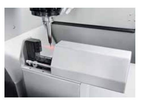
The fast tool change by means of a double gripper is a standard at exeron. The tool magazine offers space for 30, 60 or 90 tools.